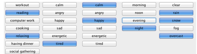
Figure 5. Screenshot of a part of the configuration interface

People describe their music preferences in sentences like “on a rainy evening, I like to read a book while listening to classical music” or “when I’m tired, house music gives me the energy to continue my workout”. Our configuration approach tries to enable users to express it in a similar way by using tags. We translated sensor information into pre-defined tags, which users can assign to radio stations by simply clicking a button. Figure 5 shows a section of this user interface with activated context-tags for a lounge radio station.