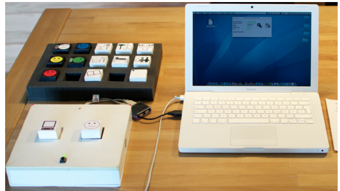
Figure 2. Setup of the system on a table.

The resulting prototype is a system that consists of a USB-device that functions as a tangible user interface, has a light sensor and a physical next-button attached to it, 9 single-sided activity cubes, 6 double-sided mood cubes, and a software application that runs on a Mac, gets weather information via a web-service, does all the reasoning, and plays back the selected music (see Figure 2). We used two Arduino Uno micro-controllers, equipped with two NFC-shields for identifying cubes and handling sensor input.