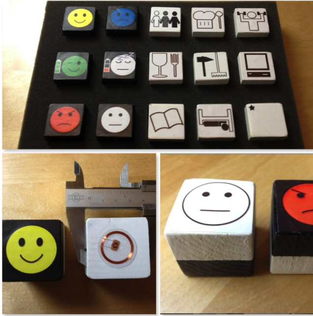
Figure 3. Cubes used for expressing moods and activities.

factor (e.g., weather) changes, new ratings are calculated and usually new music starts playing.