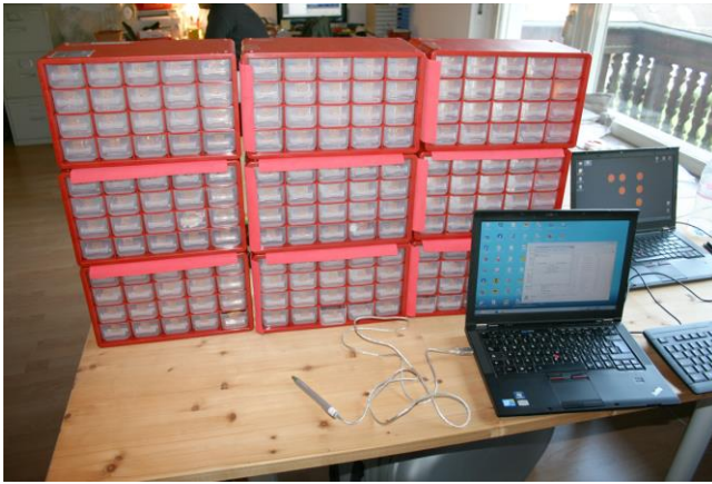
Figure 1. In this commissioning system, each compartment is equipped with an RFID tag. A text-to-speech program provides hints on finding the right compartment with the scanner.