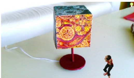
Figure 2. Flexo prototype.

This interface allows the user to interact with the smart object through an augmented reality dynamic interface and can configure the functionalities of the object at each moment based on his own needs. The aim of Smart Avatars is to redefine the interfaces for these new smart objects that can be considered as robotic entities with a new approach which aims to bring down the barriers between people and complex technology. There is no longer the need to have hundreds of input devices to interact with them because every augmented reality interface will appear when needed.