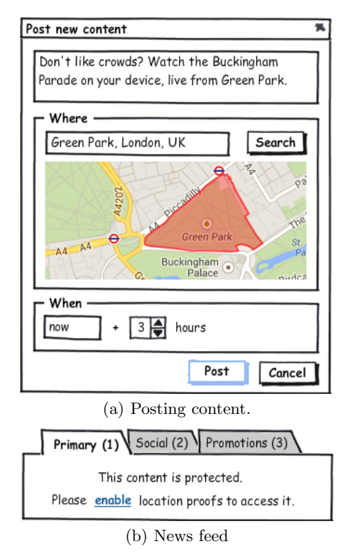
Figure 1. User interface mock-up of an application for interacting with the social city network.

city network and is further elaborated on in the remainder of this section.